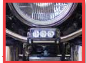
Optional Model RBKTHD5, under headlight mounting bracket kit for one TIR3, LIN3 or LINZ6 horizontal mount lighthouse