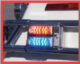
Optional Model RBKTHD2, side saddle bag crash bar mounting bracket kit for two TIR3, LIN3 or LINZ6 horizontal mount lighthoods