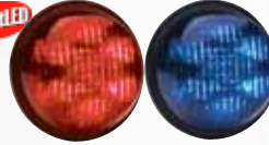
Optional 4" Round TIR6 Super-LED with extended lens