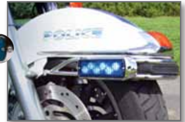
Optional 500 Series TIR6 Super-LED