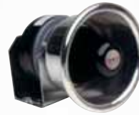
Optional SA350MH Speaker