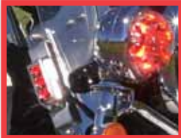
Optional Model RBKTHD1, windshield mounting bracket kit for one TIR3, LIN3 or LINZ6 vertical mount lighthouse