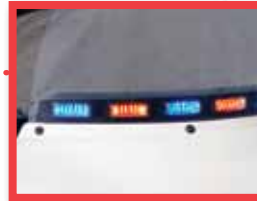
Optional Model M05ZJ, LINZ6 motorcycle windshield light array