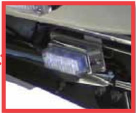
Optional Models RBKTHD4L (road side) RBKTHD4R (curb side) under radio box mounting bracket kit for one TIR3, LIN3 or LINZ6 horizontal mount lighthouse