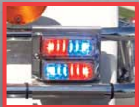
Optional Model RBKTHD3, rear saddle bag crash bar mounting bracket kit for two TIR3, LIN3 or LINZ6 horizontal mount lighthoods